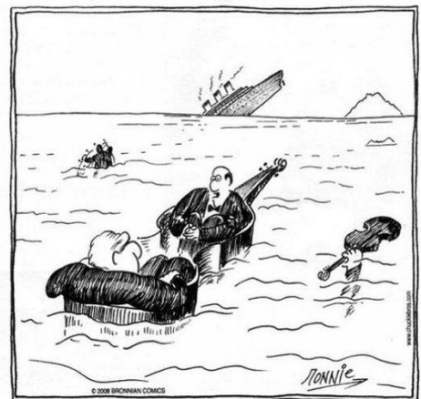
"I knew there had to be a reason I took up the double bass."