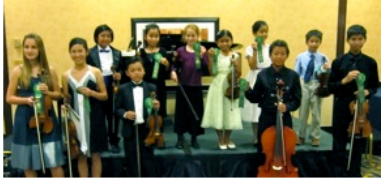
Convention Festival Recitals