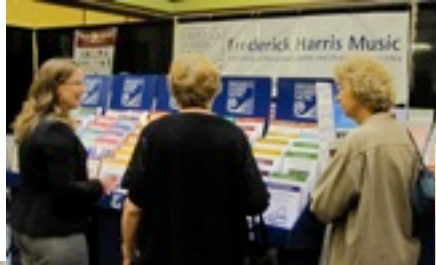
Exhibits ... lots of music at discount prices