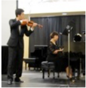
Master Class Performances