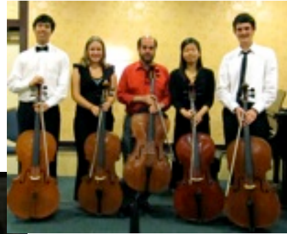
Master Class for Cellists